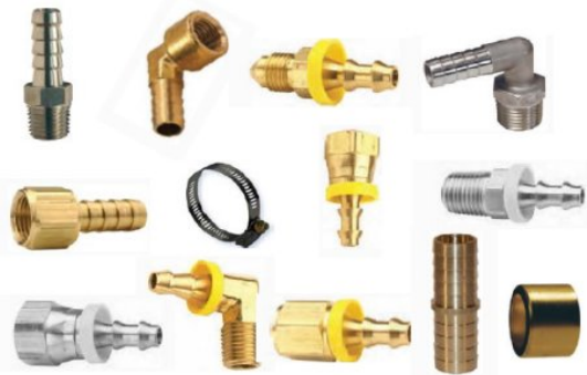
Push-On Hose Ends