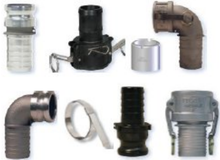
Cam and Groove Hose Ends