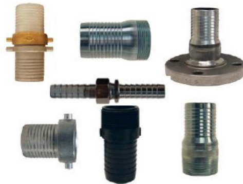
Shank / Water Hose Ends