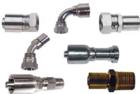
Crimp / Swage Hose Ends