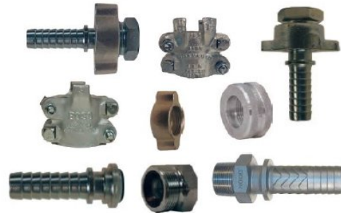
Steam Hose Ends