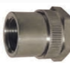
rigid female GHT x female NPTF