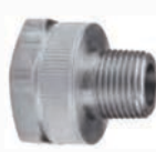
female GHT x male NPTF